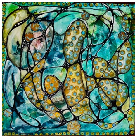
Work by Patsy Tidwell-Painton, "Islands In The Stream"

Tidwell-Painton offered the following about her painting Islands In The Stream , "This piece began with several under paintings until the surface was speaking well and deserved a neurographic drawing... Following the drawing, each color, each