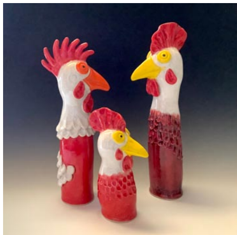
Works by Marty Biernbaum

Need mood lighting? Stacy Green has created garden themed lights with fused glass to set the stage. What can be used to serve the food for the picnic? Anne John's