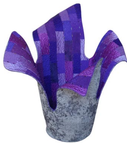
Work by Ron Hodge

7/25 - Ron Hodge, beading 8/01 - Peg Weschke, painting on fabric 8/08 - Jody Wigton, open weaving in art quilts