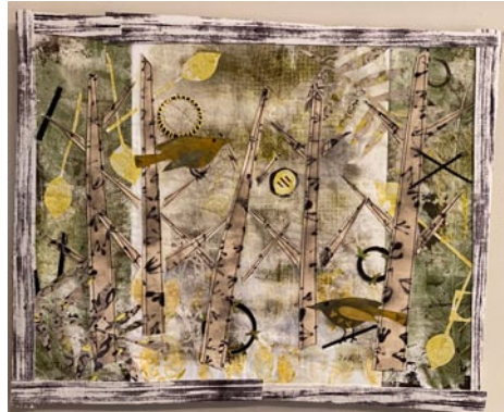
Work by Jody Wigton

Imagine is an immersive art exhibit that explores the power of imagination. The award-winning fiber artists and art quilters fuse fabric and thread to delve into the transformative and introspective nature of imagining one's own world. By fostering a space for creativity and self-reflection, Imagine aims to inspire attendees to reimagine the world around them.