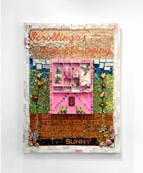
Work by Kate Burke

Burke offered the following artist statement, “Having grown up in Southern Baptist culture, the questions of control, Page 10 - Carolina Arts, July 2025