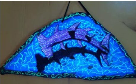
Work by Sally Weber

The artists exhibiting are all members of the Artists Collective, and they are “delighted to challenge themselves to work with such an awesome different kind of medium,” she adds. “The Collective is a great place to learn skills on showing our work.”