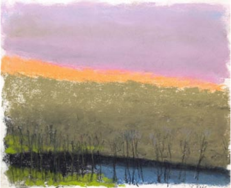
Work by Wolf Kahn

The gallery is proud to represent artists from all geographic regions, consequently, our artists reside all over the United States, as well as Argentina and Spain. Equally diverse as where the artists live are the