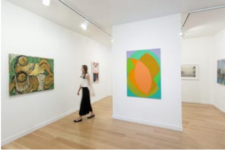
View inside SOCO Gallery