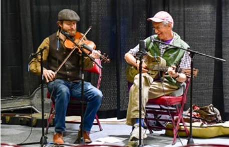
View of some of the live musical entertainment offered at the Fair

Founded in 1930, the Southern Highland Craft Guild is a nonprofit, educational organization that brings together craftspeople of