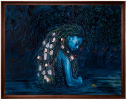
Richard Nattoo, “River Mumma II”, 2024, Water-colour, Pen & Ink, Water from the Rio Grande and Benta River, Jamaica on Canvas. 39 x 50 in | 99 x 127 cm

Across the Atlantic World - from West Africa and Europe to the Americas - Black creatives have been at the forefront of defining what it means to be Black. re/Defined examines how artists from the US and the broader African Diaspora have challenged stereotypes by preserving African traditions, resisting systemic oppression, and activating audiences. Through the mediums of fine art, adornment, music, and storytelling, this exhibition showcases how Black creatives have shaped cultural narratives and used their work to advocate for the communities to which they belong.