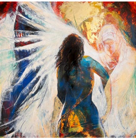
Work by Chrys Corn Goodman

Ridenour has always had a love and passion for creating, but it wasn’t until 2019 on a back-packing trip through Asia and Australia that she decided to pursue art full time. Since then she has produced murals and shown her work in numerous solo and group exhibitions throughout the Carolinas. In 2023, Ridenour completed an ambitious series that led to her book containing 365 illustrations, each one serving as a daily