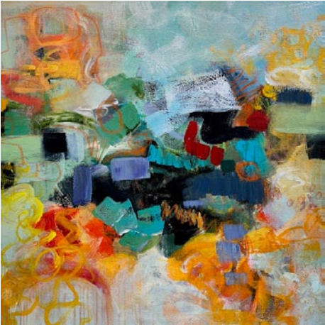
Work by Peg Bachenheimer

“I work in a variety of media at different times. Lately I have been exploring acrylic paint with various drawing and collage materials and find it allows me to paint more freely,” adds Bachenheimer. “I also find oil paint mixed with cold wax medium as well as encaustic, pigmented hot wax interesting to work with. All my work involves building up layers and subtracting from them until the painting feels complete.”