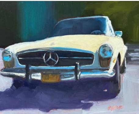
Work by Dan Graziano

The Red Piano Art Gallery , 40 Calhoun St., Suite 201, next to the Cottage Cafe and above Gigi's, enter at the left side of the building, off the courtyard, Bluffton. Ongoing - Presenting a broad collection of 19th and 20th century representational American paintings and sculpture. Landscapes, still lifes, genre scenes, figures and historical subjects by many of America's leading representational artists, impressionists and expressionists are available for discriminat-