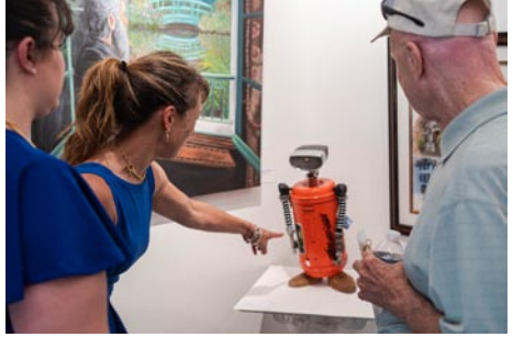
People enjoying the opening of the Goose Creek Artist Guild exhibition

From the popular Goose statues (available for purchase for all City businesses) to fantastic murals added to commercial buildings around town; from banners created by the City's youngest artists to traffic box wraparound displays that make catching a red light a little more enjoyable, Goose Creek's love for the arts is easy to notice.