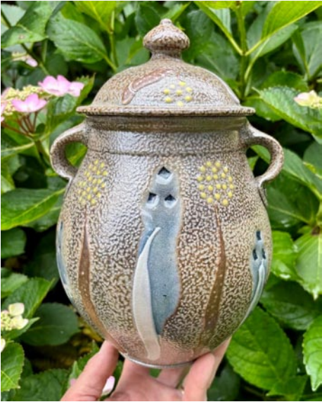
Work from Mark Hewitt Pottery