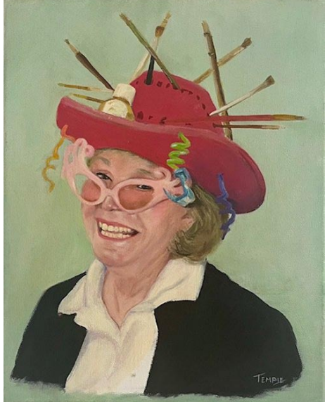
Work by Tempie at 843/887-3157 or visit (www.mcclellanvilleartscouncil.com).

For further information check our SC Institutional Gallery listings, call the Council