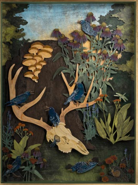
Work by Bess Whittington

Southeast Center for Photography, 116 E. Broad Street, Greenville. Ongoing - An exhibition and education venue promoting the art and enjoyment of fine photography. Through monthly juried exhibitions, local, national and international photographers of all skill levels have the opportunity to have their work presented and enjoyed by collectors, curators, enthusiasts, interior designers, and colleagues. In addition, exceptional photographers will be invited to participate in solo or group shows. Our workshop and class schedule cover all aspects of photography and challenges, encourages and inspires the photographer in all of us. Hours: Wed.-Sat., 10am-5pm and First Fridays until 9pm. Contact: 864/605-7400 or at (www.sec4p.com).