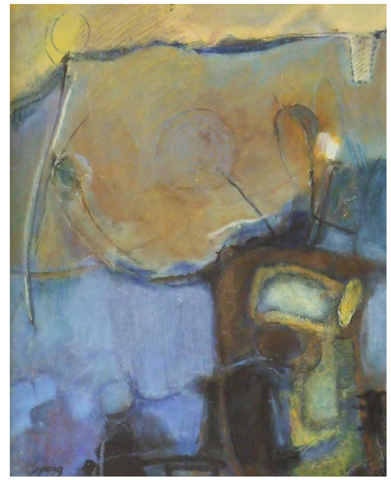
Laura Spong, Remote Control, 1960's and 1990's, Oil on Masonite, 20 x 16 inches