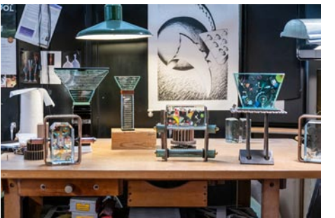
Carl Powell glass sculptures

The deadline each month to submit articles, photos and ads is the 24th of the month prior to the next issue. This will be Sept. 24th, at 5pm for the October 2024 issue and Oct. 24, at 5pm for the November 2024 issue. After that, it's too late unless your exhibit runs into the next month. But don't wait for the last minute - send your info now to (<u>info@carolinaarts.com</u>).