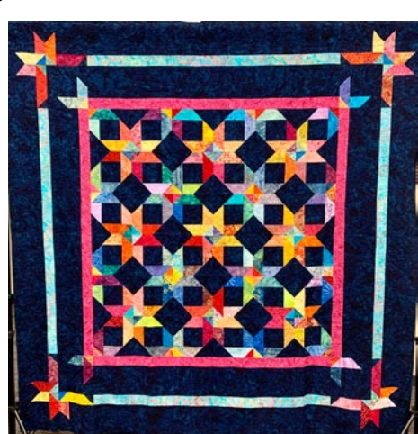
Opportunity Quilt made by PhD (Projects Half Done Bee to be raffled off during the show

- View Special Exhibits such as quilts by Mountain Art Quilters on the theme of "Reflections: Connecting to Nature" and special Ruby Anniversary Quilts made by Guild members - Peruse the Gift Shop and Gallery brimming with handcrafted quilted items to enhance their homes - Shop for the latest quilting and sewing products being sold by 27 regional vendors - Get a real bargain for gently used sewing/ quilting supplies, fabrics and books/patterns at the What's Old Is New booth - Take a $1 chance to win the exciting Opportunity Quilt made by the PhD (Projects Half Done) Bee - Enjoy the odds at the Product Raffle that gives away prizes donated by sponsors and vendors many times each day To encourage the next generation of quilters the Guild offers a Kids Sewing Area where children from 4-12 years old create their own sewn projects to take home with them.