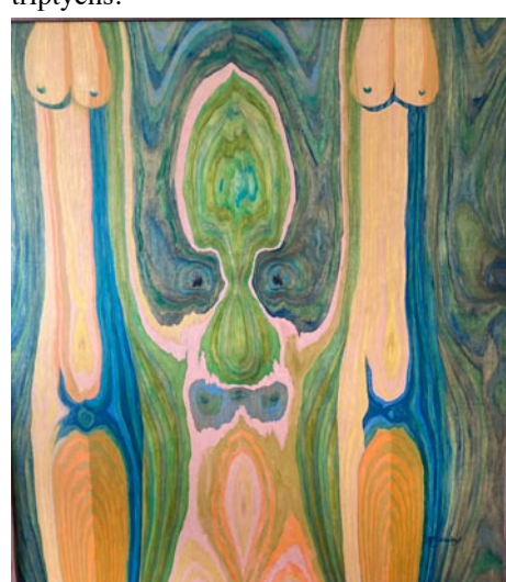
Work by Karen Kopf

Then the artist began painting on wood itself and sometimes created images based on what she saw in the grains and sometimes created images with the grain of the wood encapsulated in the strokes. This part of the exhibit includes flat panels of wood as well as other formats such as triptychs.