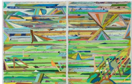
Paul Yanko, "Extended Expanded Demarcated", Acrylic on Arches paper, 30 x 44 inches, 2023

Yanko's work has focused on developing a response to abstraction that addresses nuances of color and surface along with the representation of flat and illusionistic space. He has described his work as "an ongoing exploration in the development of disparate and complex surface qualities reconciled through various means of paint application." His bright and color-packed paintings are meticulously built in layers of acrylic paint mixed with various mediums over collaged surfaces, resulting in an intriguing terrain of fluctuating surfaces.