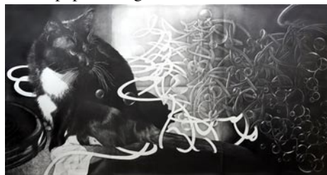
Work by Mayuko Ono Gray

"At high school age, in preparation to entrance exam to art university in Japan, I had to take private lessons to learn drawing with graphite and charcoal practicing techniques such as chiaroscuro and sfumato. Saturday afternoons were replaced by a Western style art studio with pedestals, still lifes, and white marble copies of Roman busts, instead of tatami mat calligraphy studio sitting on the floor. The fluid ink was replaced with malleable graphite and ephemeral charcoal. The wet immediacy of calligraphic line was replaced with illusionistic volumes meticulously rendered. Instead of going through dozens of rice papers in a session, one sheet of high-quality cotton paper was given to work on."