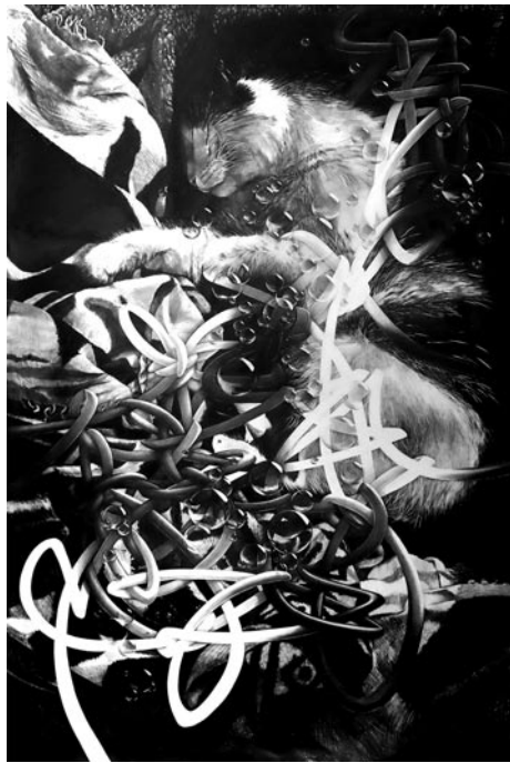
Work by Mayuko Ono Gray

"Traditional Japanese art-forms have often integrated word and image, and my interest and practice also follow the path in my unique way. In my works I mostly use images of persons, animals, and still-lives captured in my daily experiences. I assign a matching Japanese proverb to go with the