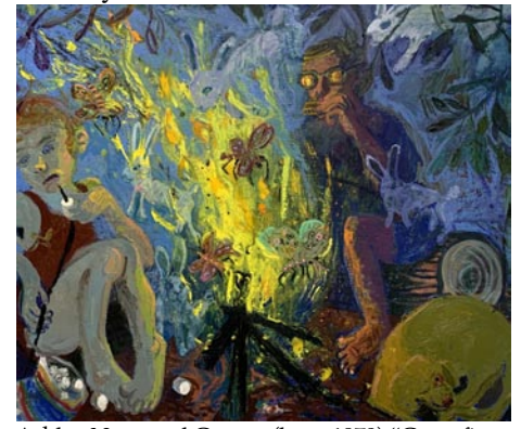
Ashley Norwood Cooper (born 1970) "Campfire with Ghost Rabbits" 2022. oil on linen

Our policy at Carolina Arts is to present a press release about an exhibit only once and then go on, but many major exhibits are on view for months. This is our effort to remind you of some of them