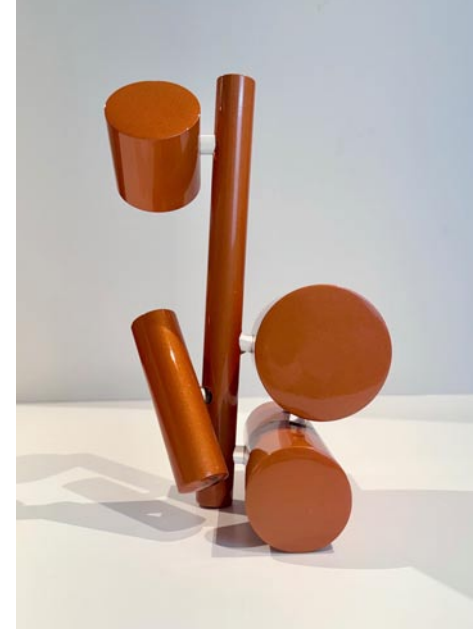
Work by George Snyder

George Snyder, whose career dates to the 1970's, presents a collection of freestanding tube objects. The cylinder-tube is the "most basic element" in his work Snyder says. The cylinders are assembled in geometric post-modern towers. The hard glazed surfaces are car paint, the pure colors so vibrant that they are almost phosphorescent. A coating of wax polishes the color outbursts to a high lacquer shine. The surface is seductively smooth and