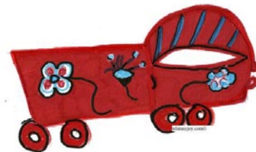
"Whimsy Joy Truck"

"Soon, I get to Go to School. I will follow All the Rules. ABC, 123, I will learn what They Teach to Me."