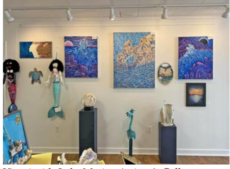
View inside Lake Marion Artisan's Gallery

Lake Marion Artisan's Gallery, 108 Main Street, Summerton. Ongoing - Operated by the Lake Marion Artisans (LMA) an organization which is