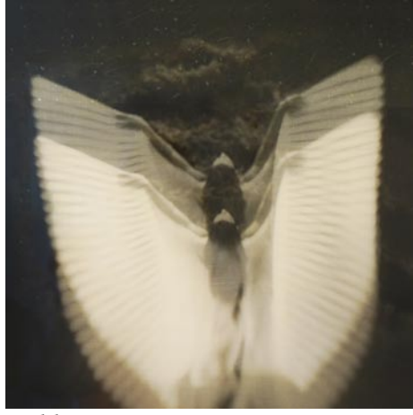
Work by Kirsten Hoving

In others, an image on clear plastic is stabilized on a transparent substrate that, in turn, is lifted over a secondary digital photograph or hand-made paper collage to create an unexpected three-dimensional effect. Hoving's combination of photographs with silk fabric, plastic, paper, and more creates mysterious images that allude to poems, myths, and transcendent experiences.